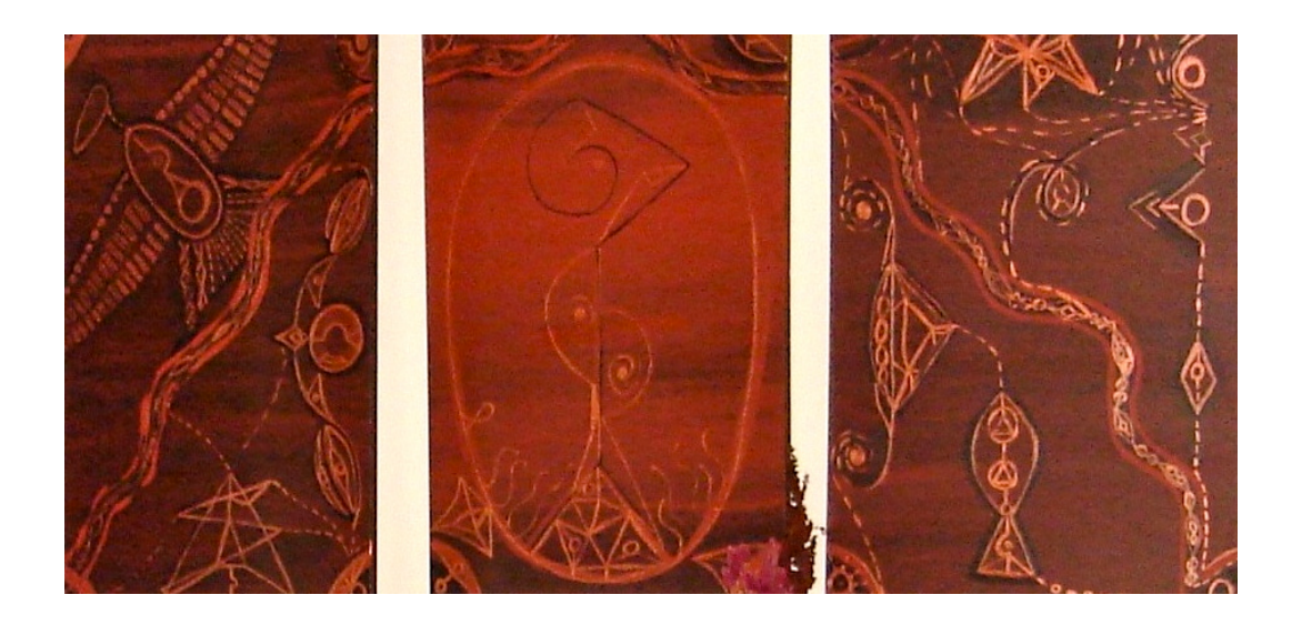
Figure E2. Photography of Creative Synthesis No. 2, (2012), by Yalila Espinoza.