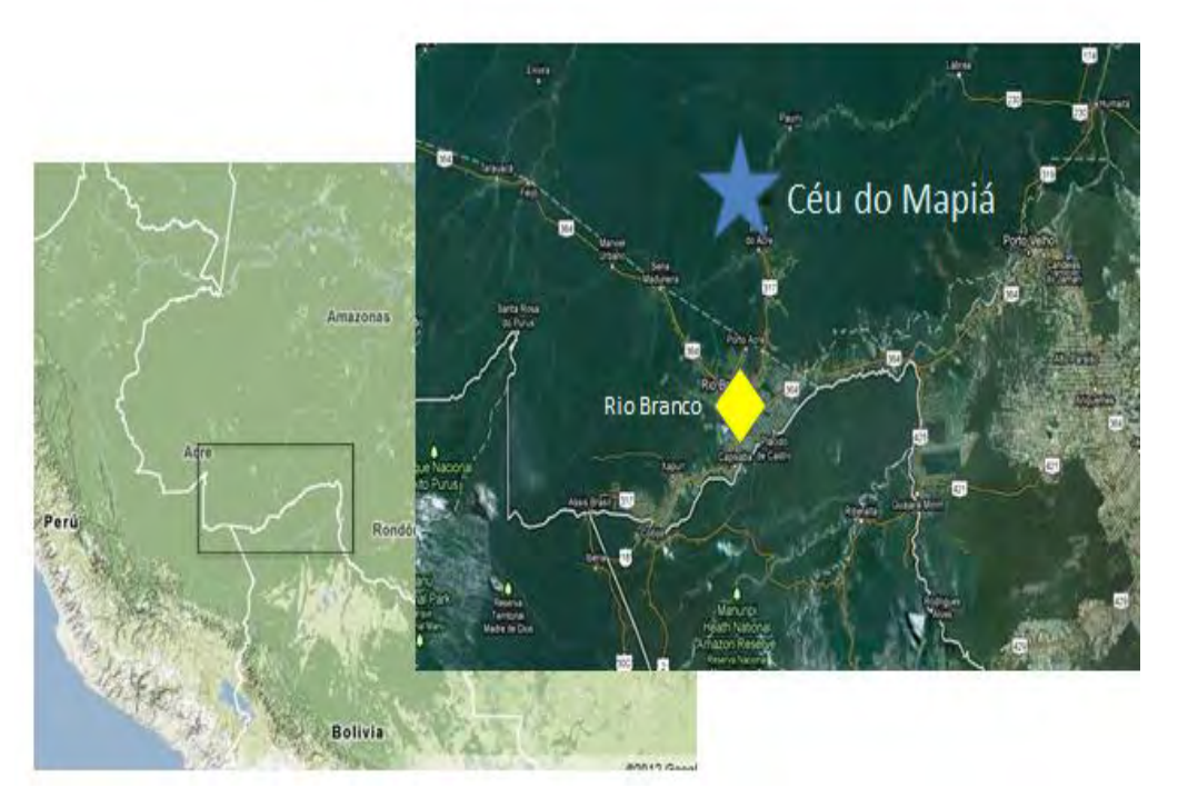
Figure 2: Map of Geographic Region and Location of Study Site.

While the Amazonian rubber market had collapsed by the 1910s, rubber tapping, as well as other extractive practices, remained important to the local population in the