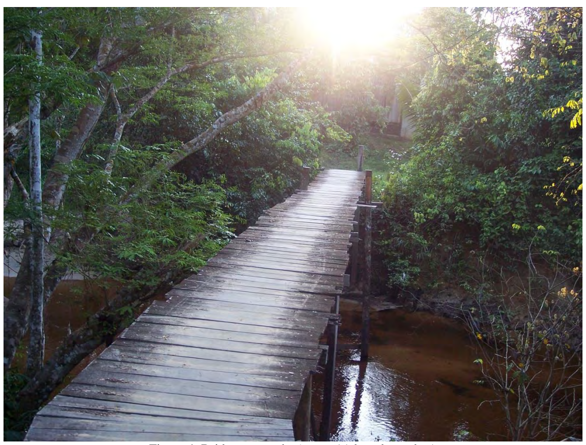
Figure 4: Bridge across the igarapé

Chapter four returns to the site of Céu do Mapiá, this time to analyze the sensual, daily geographies of the community. Of particular importance is the soundscape of the community which marks the community's transition into a village more integrated into the surrounding locales as well as the hymns that articulate the doctrine of Santo Daime. The chapter also shows the evidence on the cultural landscape of the various ways its traveling has wrought on the community.