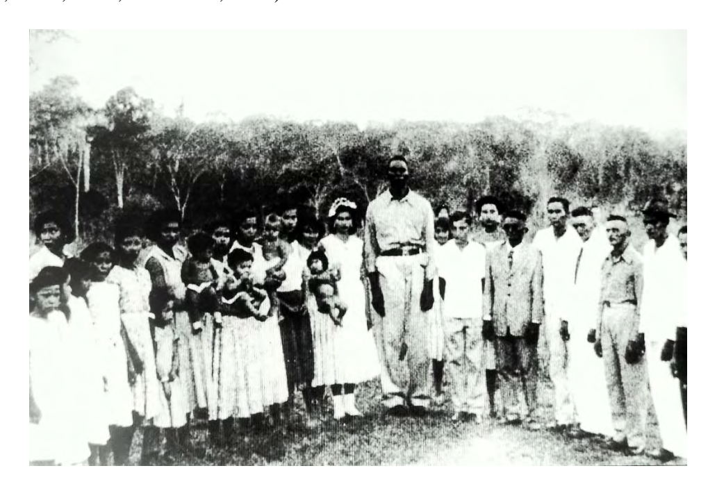
Figure 5: Raimundo Irineu Serra with followers

chain of landowners, local merchants, the wholesalers known as rubber barons in the big cities of Manaus and Belém, then shipped to Liverpool and New York where it ended up in industrial centers, like the Goodyear Tire factories in Akron (Barham & Coomes, 1996; Dean, 1987; Weinstein, 1983).