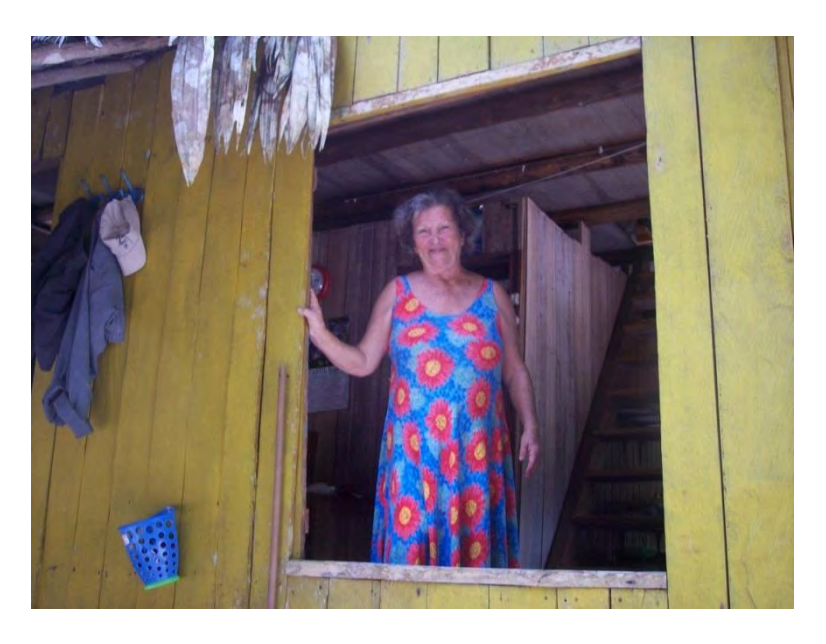
Figure 3: A mapiense in her home