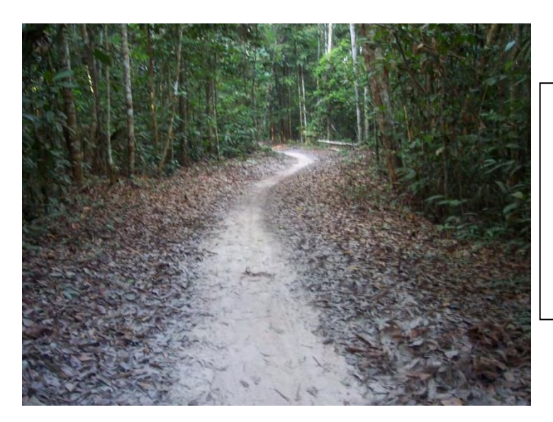
Figure 9: Sandy trail through the forest

Starting early in the morning and continuing throughout the day, both make their presence felt in the soundscape of Mapiá, cutting through the dripping sounds of condensation pinging against the leaves as the moisture steadily drops from the canopy to the ground, and the constant, whomping hum of insects and the interjected screeches of birds and monkeys. The two are quite different. The diesel generators are used for generating electricity in the homes and small businesses of the community, and increasingly to power groundwater wells. The sound they make, after the stutter of firing them up, is a steady chug, a sound that has become ubiquitous throughout Mapiá. Motorcycles, on the other hand, are startling. They can descend upon you suddenly, from behind or ahead while one is walking along the sandy trails. Sometimes, when the wind is just right, you can hear their roar emanating in the distance.