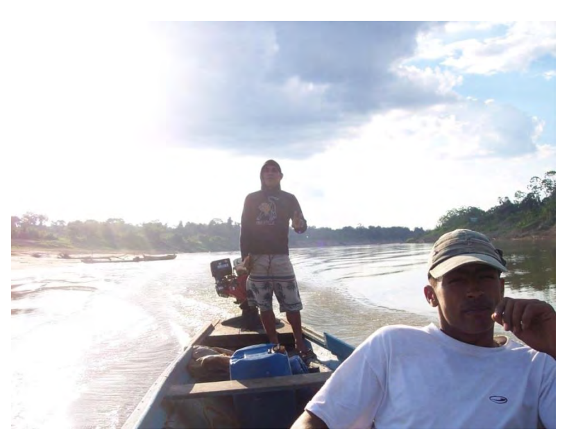
Figure 8: On the Purus River, heading towards Boca do Acre

this is usually as far as they go. They hang out on the steps outside the Hotel Floresta or at the docks where the River Branco and the River Purus join, smoking and laughing, and perhaps taking advantage of the opportunity to buy beer, or cachaça, something prohibited back at Mapiá. Most will stay a few days, buy supplies in bulk for their families and others, and wait to have a few passengers to take back to Mapiá. Others will work temp jobs in construction or on a nearby cattle ranch before going back home. One man I interviewed had a job working as a campaign assistant for a local politician who also happened to be a daimista. For these men, as most of those who make this type of journey, Boca do Acre is the end point. Barring a rare trip to the capital city of Rio Branco, this urban outpost representing an escape from the community demands of Mapiá as well as a threatening, insecure environment. As another informant told me, "we have to go to Boca do Acre, but it's not because we like it." He went on to say that he and others often get stomach problems from the food there.