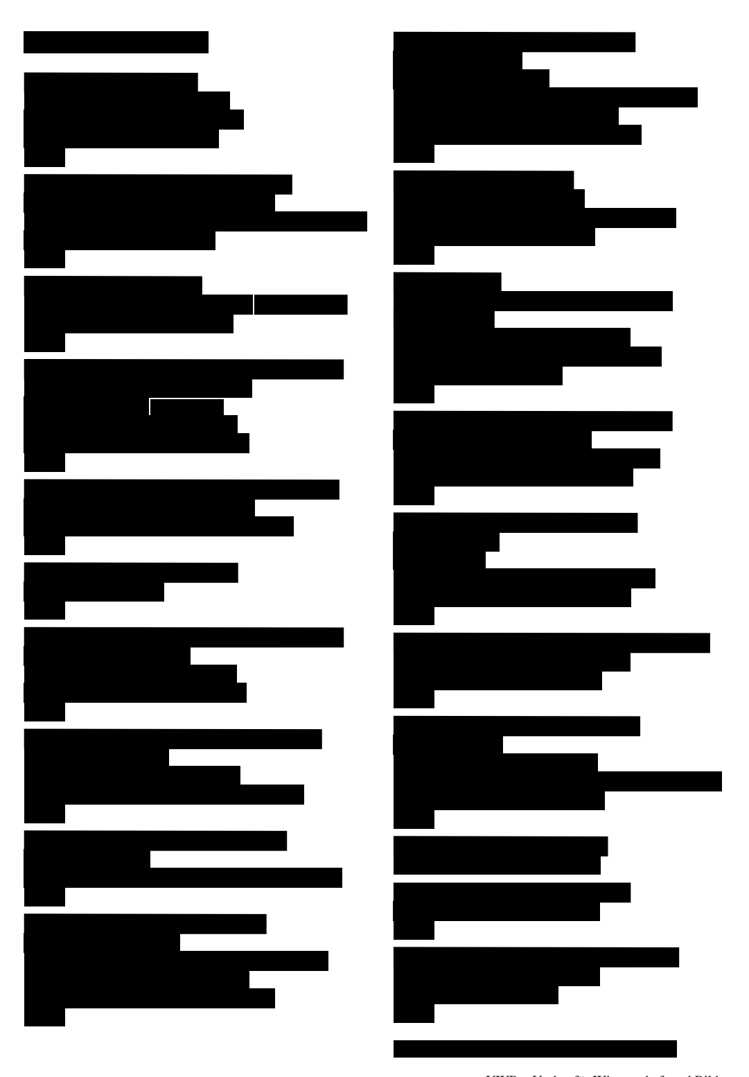
VWB – Verlag für Wissenschaft und Bildung